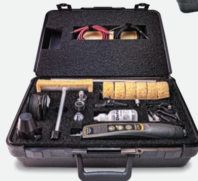
Complete Kit shown