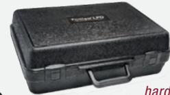
Both kits include a hard shell case