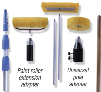
Paint roller extension adapter