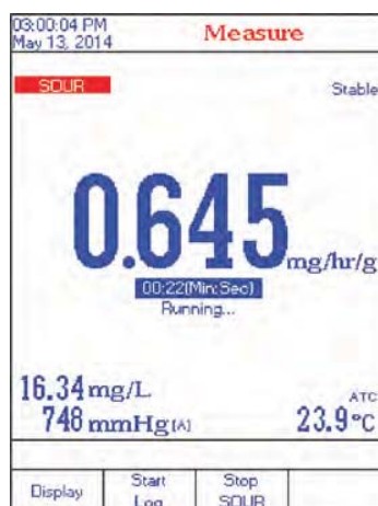
SOUR (Specific Oxygen Uptake Rate)