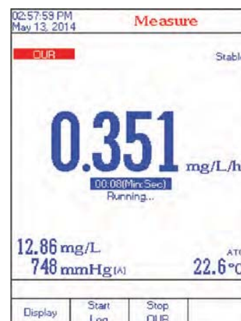
OUR (Oxygen Uptake Rate)